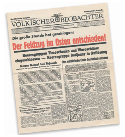
Front page of Völkischer Beobachter, October 1941, celebrating military gains in Eastern Europe.